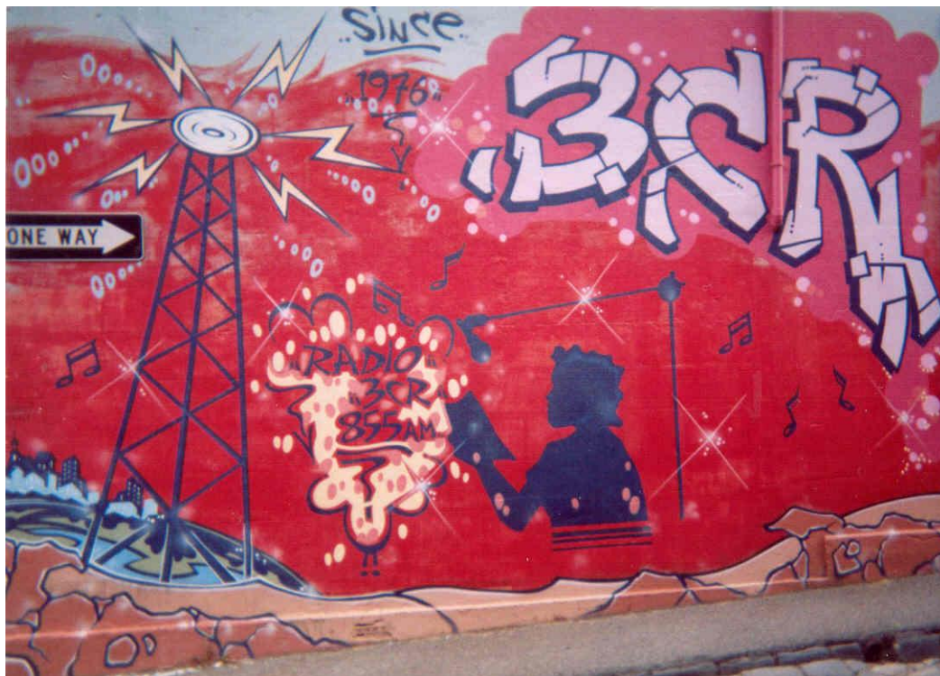
Outdoors wall art, 3CR Melbourne, Australia.

The Radio Heritage Foundation is a registered charitable trust in New Zealand. From April 2008, you'll be able to see our financial accounts and budget online. Donations of $5 or more in New Zealand are tax deductible. We receive no regular funding from any source and are denied funding by New Zealand On Air. Please support our helpful partners www.2day.com , ProCopy [email: mike@procopy.co.nz ] and www.pcwiz2u.co.nz . Our address: PO Box 14339, Wellington 6241, New Zealand. info@radioheritage.net and our website: www.radioheritage.net